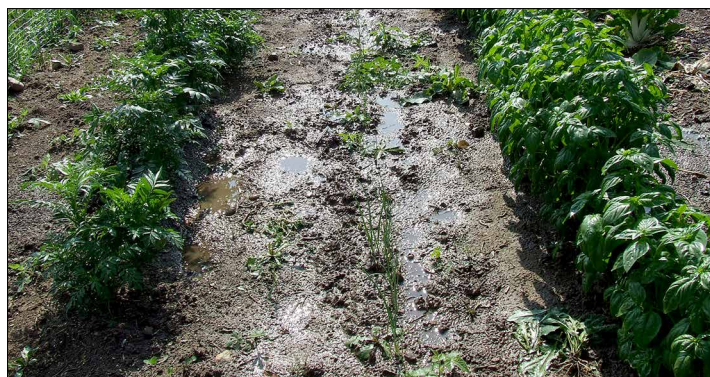
Soils with appropriate amounts of organic matter will have better porosity and water infiltration, preventing the pooling of water as seen here.

Before deciding to fertilize, determine the soil type, pH, nutrients in your garden soil, and the nutrient