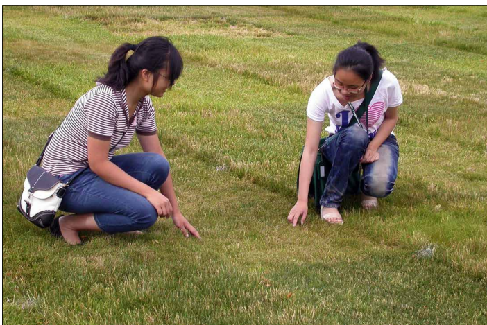
Lawns mowed at 3.5 or 4 inches out-compete weeds, tolerate grubs and look just as good as lawns mowed at 2.5 inches.

The highest setting on your mower! The top setting for most mowers gives a cutting height between 3.25 and 4 inches. This is best for your lawn, but at a setting of 4 inches you may sometimes see some "laying-over" of turf blades that some people find undesirable. For this